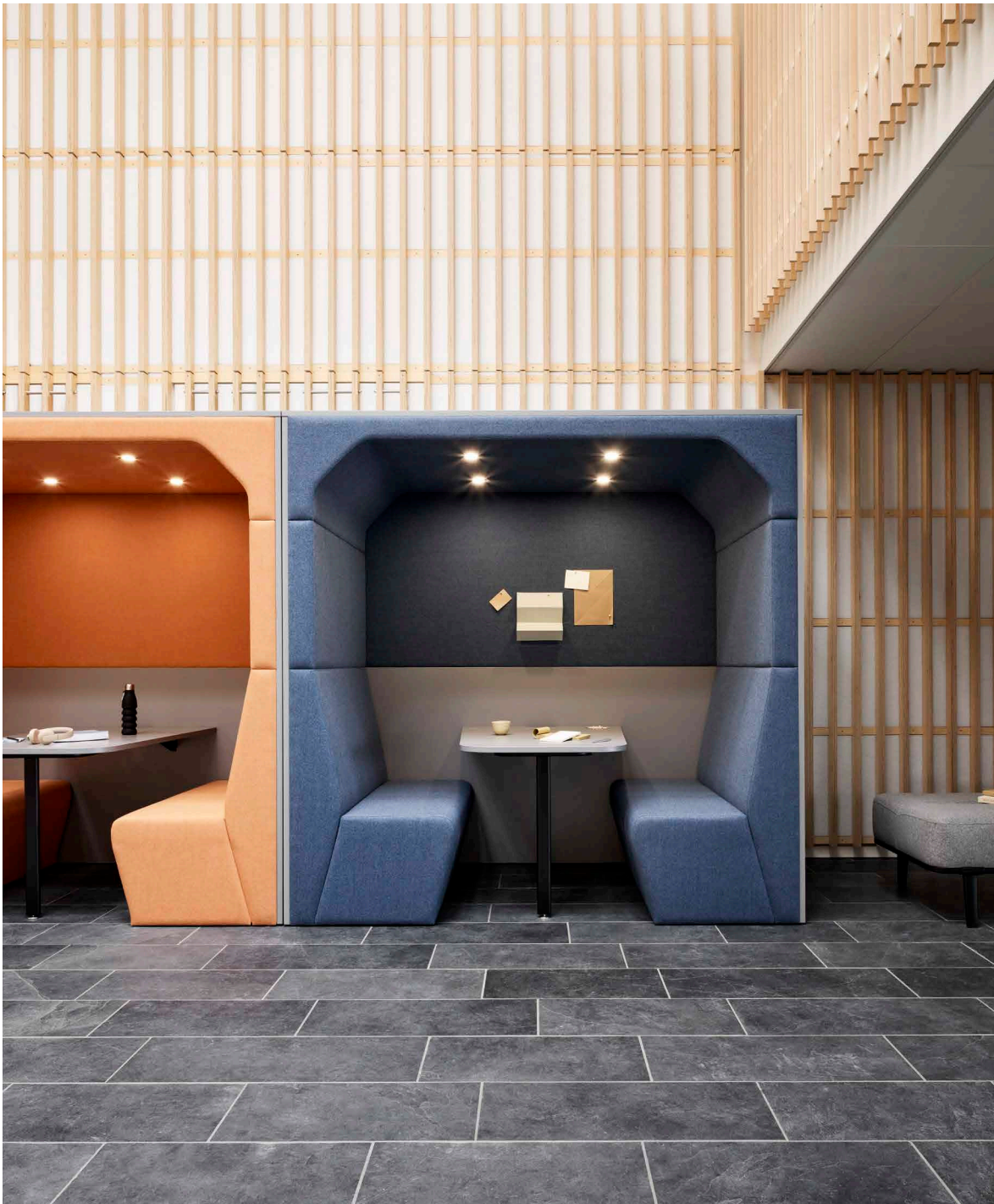
↓ Shard 2.0 Pods

Each Shard 2.0 is clad with Senator standard 0.7" TFL. The roof is fitted with PIR activated downlights, meaning the light will activate with movement and can be modified to suit.