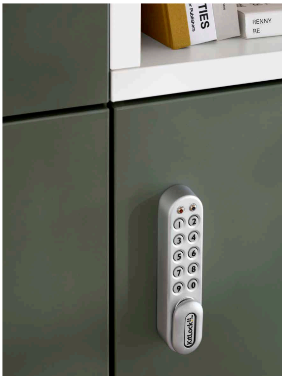
← Digital Locking Mechanism